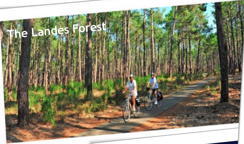
The Landes Forest